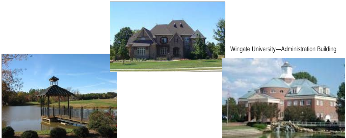
Wingate University—Administration Building

Monroe is the county seat of Union County where you'll find quaint downtown shops as well as hiking and horse trails. In fact, Union County is home to the largest equestrian population in the entire state!